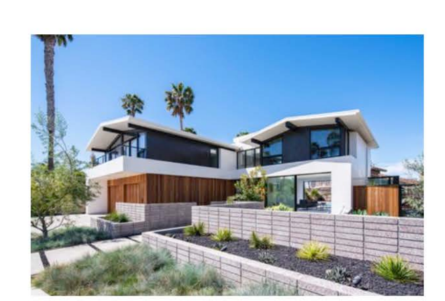
Phelps Residence Huntington Beach, CA Assembledge+