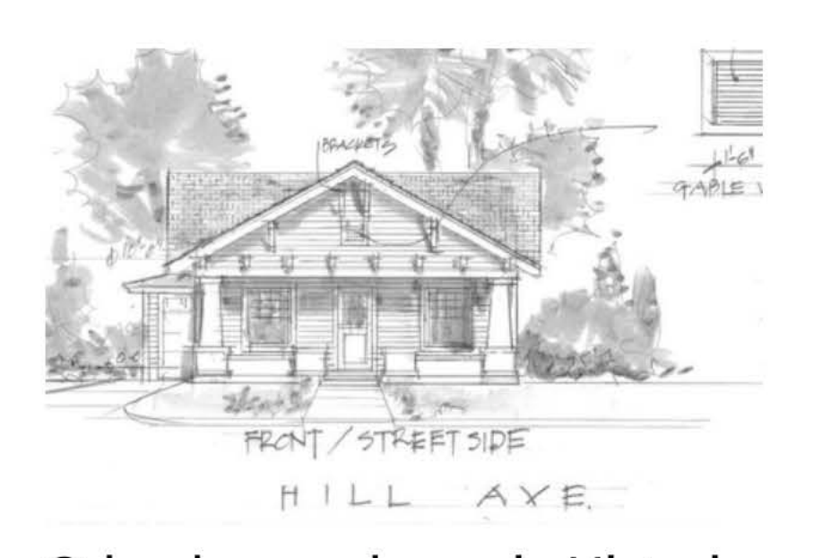
Orlando spec home in Historic neighborhood Orlando, FL John Henry Masterworks Design International, Inc.