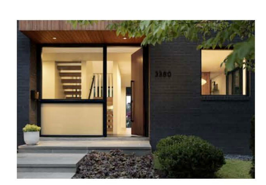
Stephenson House Washington D.C., DC Assembledge+