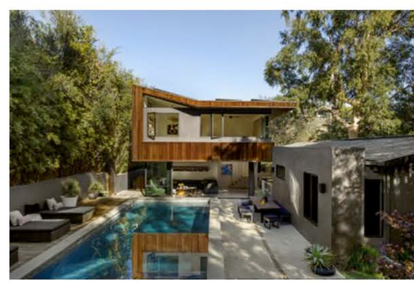
Wonderland Park Residence Los Angeles, CA Assembledge+